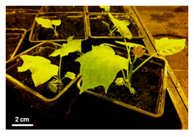
Figure 3. Potted J. curcas plantlets after 6 wk on rooting medium \frac{1}{2} WPM+2.5 \mu M IBA+238 \mu M PG followed by 6 wk of acclimatization in the glasshouse.

Effect of light quality on Jatropha root induction. The spectrum of light during in vitro culture is important not only for healthy morphological characteristics but also for the efficiency of adventitious root formation (Iacona and Muleo 2010). LED allow illumination of relatively narrow wavelengths of light within the photosynthetic spectrum (Tennessen et al. 1994). We used different LED light sources to monitor the impact on rooting of in vitro Jatropha shoots. Shoots were rooted after 2 wk of cultures in half-